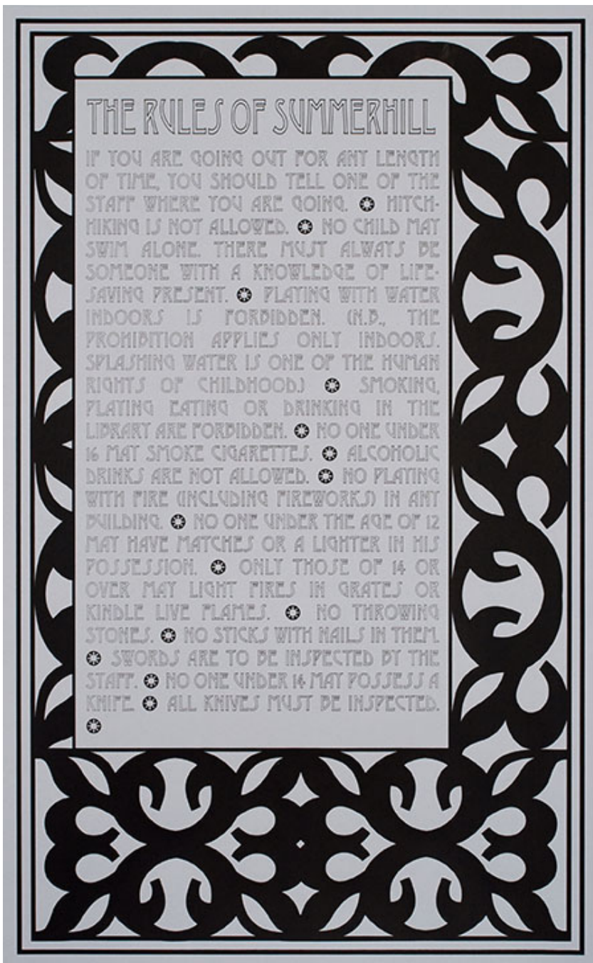
The Rules , 2007, silkscreen on paper

Digression is also fundamental to Endless Renovation (2010), an installation and slide projection shown at Washington Garcia in Glasgow. Sworn found the slides – around 600 of them – in a skip near to her studio, and set about creating an audio narrative in which she seemingly analyses the mundane scenes of (amongst other things) the corners of rooms, light fittings and potted plants. Touching on Vilém Flusser’s phenomenology, Charles Bernstein’s poetry, and Richard Linklater’s film Dazed and Confused (1993), the fusillade of references are overwhelming. The argument is hard to follow, as the spoken texts are appropriated from an array of sources (like the slides, they are found, and thus communicate nothing directly attributable to the artist’s life). The installation’s artifice is